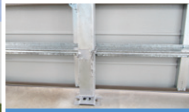
Heavy Duty Wind Brace Post

Superior strength and rigidity are qualities of the unique design of the Steel-Line Wind Brace system for sectional garage doors used in high wind and cyclonic locations.