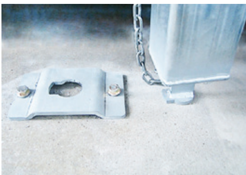
Locking Base Plate Fix to Floor