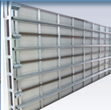
Internal View without Brace