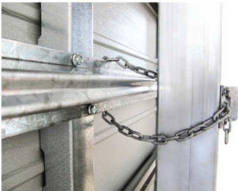
Typical Post to Strut Connection Details